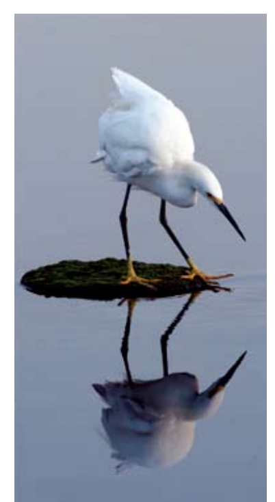
\underset{\tiny{}}{Snowy} \, Egret