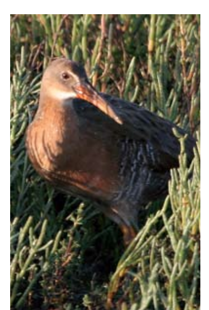
Light-footed Clapper\ Rail