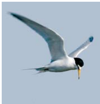
Least Tern