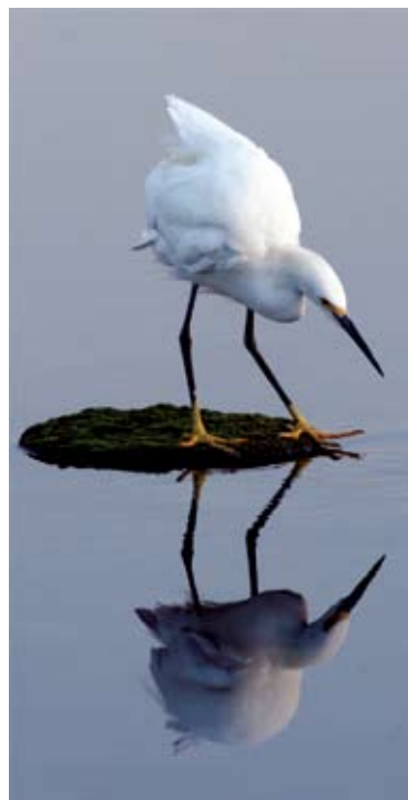
Snowy Egret