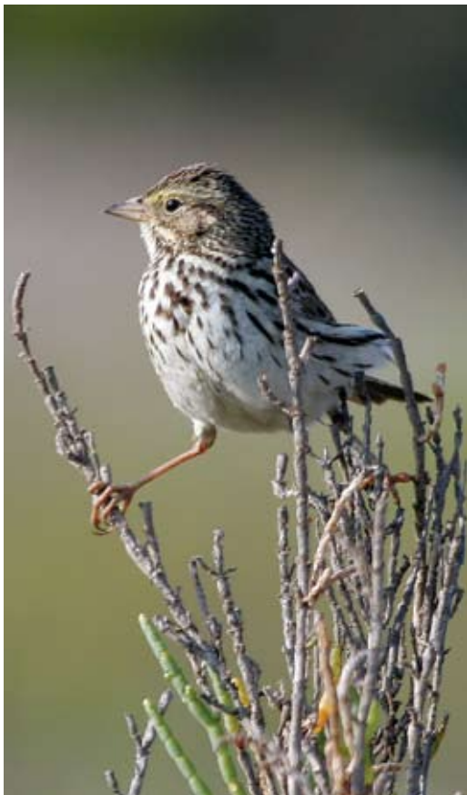
Belding's Savannah Sparrow