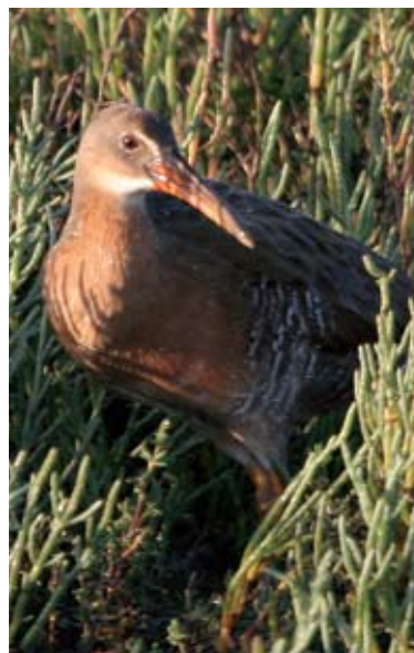
Light-footed Clapper Rail