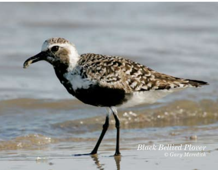
Black Bellied Plover

The refuge is designated a "Globally Important Bird Area" by the American Bird Conservancy and during winter months has one of the highest concentrations of raptors anywhere in the U.S. More than 200 species of birds, including the endangered light-footed clapper rail, California least tern, and Belding's savannah sparrow, can be found within the refuge and on adjoining Navy lands.