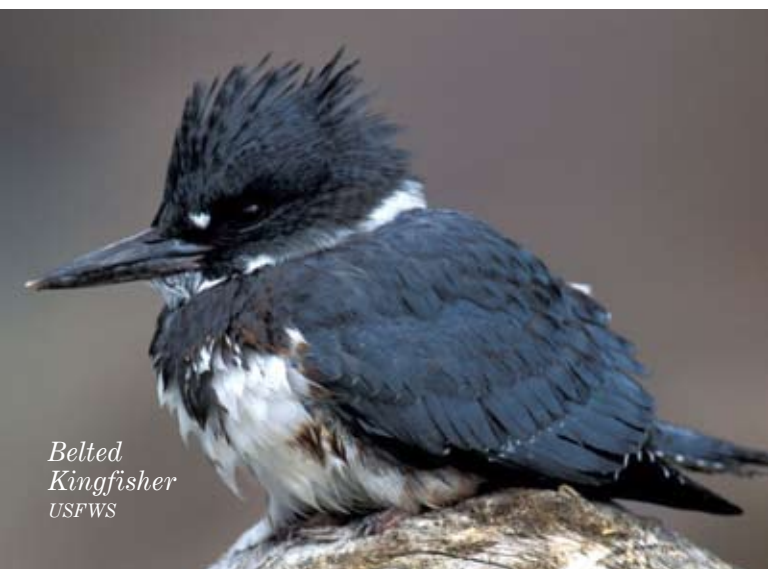
Belted Kingfisher USFWS